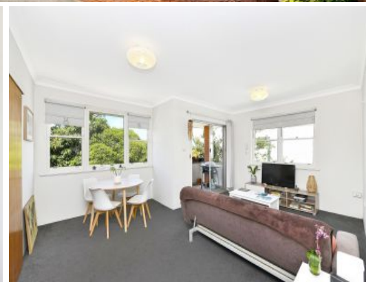
9/317 Maroubra Road Maroubra, NSW