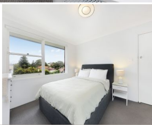
18/133-135 Bunnerong Road Kingsford, NSW